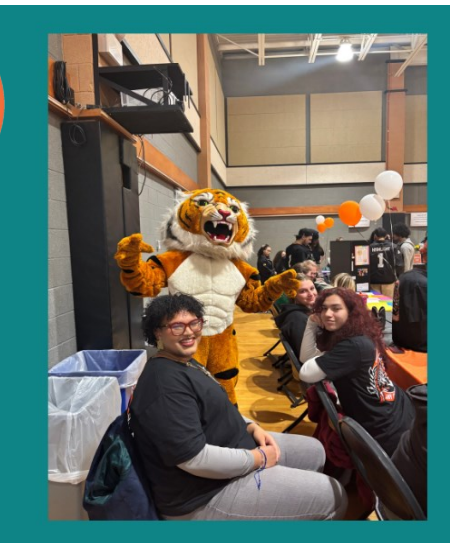
Student Government Association Senators with mascot Coby T Tiger

Students explore future careers, identify common interests and develop leadership skills through participation in clubs including: Agricultural Engineering, Plant Science & Sustainability, Pre-Veterinary, Livestock, Waterfowl, Equines, Canines,